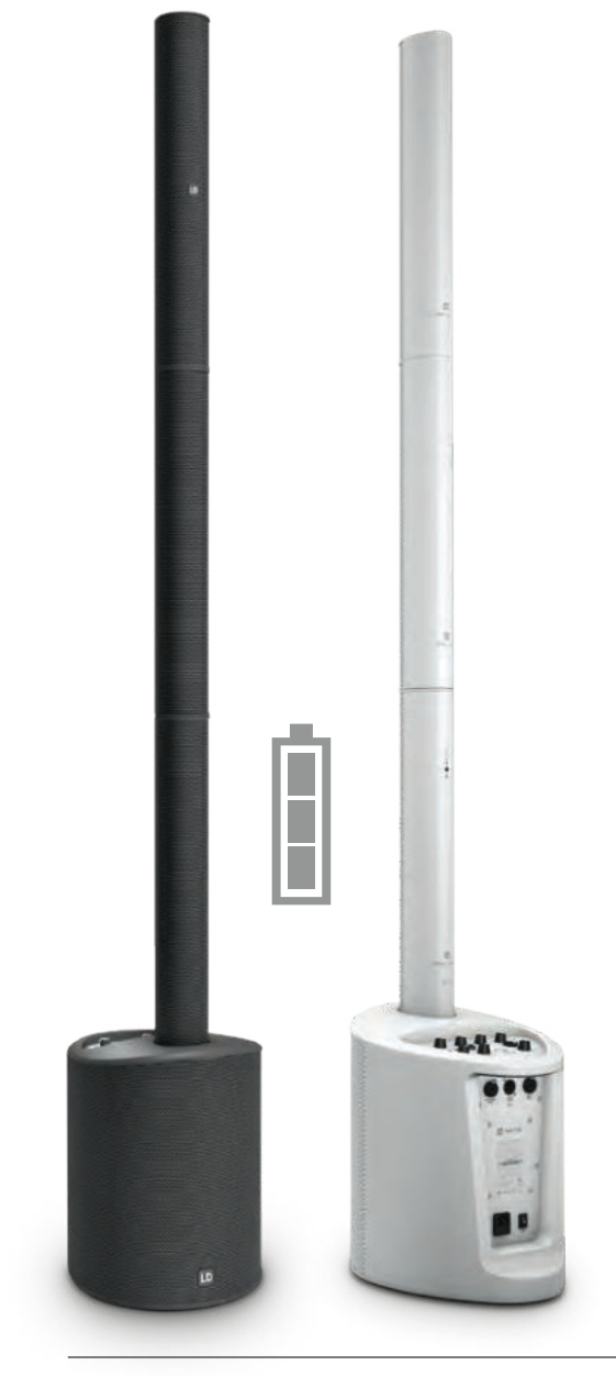
MAUI® 5 GO (W) ULTRA PORTABLE BATTERY-POWERED COLUMN PA SYSTEM WITH MIXER