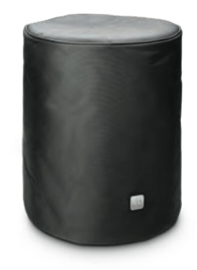
MAUI® 5 SUB BAG PROTECTIVE COVER FOR MAUI 5 AND MAUI 5 GO SUBWOOFER