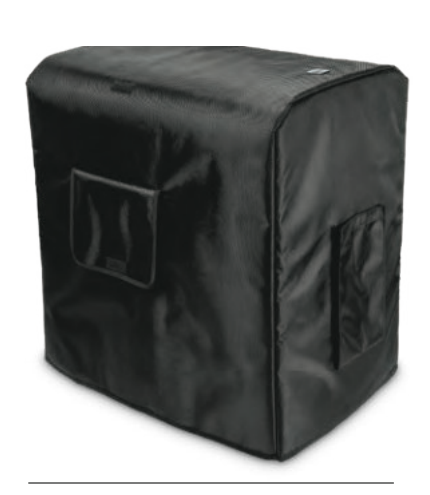
MAUI® 44 G2 SUB PC PROTECTIVE COVER FOR MAUI 44 G2 SUBWOOFER