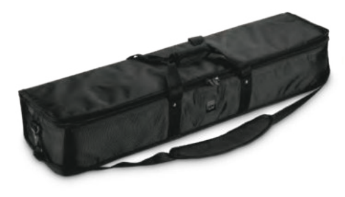
MAUI® 44 SAT BAG TRANSPORT BAG FOR MAUI 44 G2 COLUMN SPEAKER