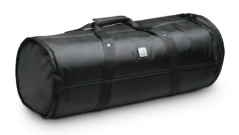
MAUI® 5 SAT BAG TRANSPORT BAG FOR MAUI 5 AND MAUI 5 GO COLUMN SPEAKERS

MAUI® 11 G2 SUB PC PADDED SLIP COVER FOR MAUI 11 G2 SUBWOOFER